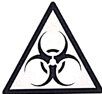
Bio Hazard Symbol